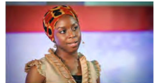
The danger of a single story © 2009 TED Talks. All rights reserved. TED Talks is a registered trademark of TED.

Can we conform with incomplete and inaccurate narratives? in 2025? from either the Global North? or the Global South?