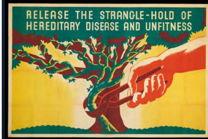
A Eugenic Society Poster