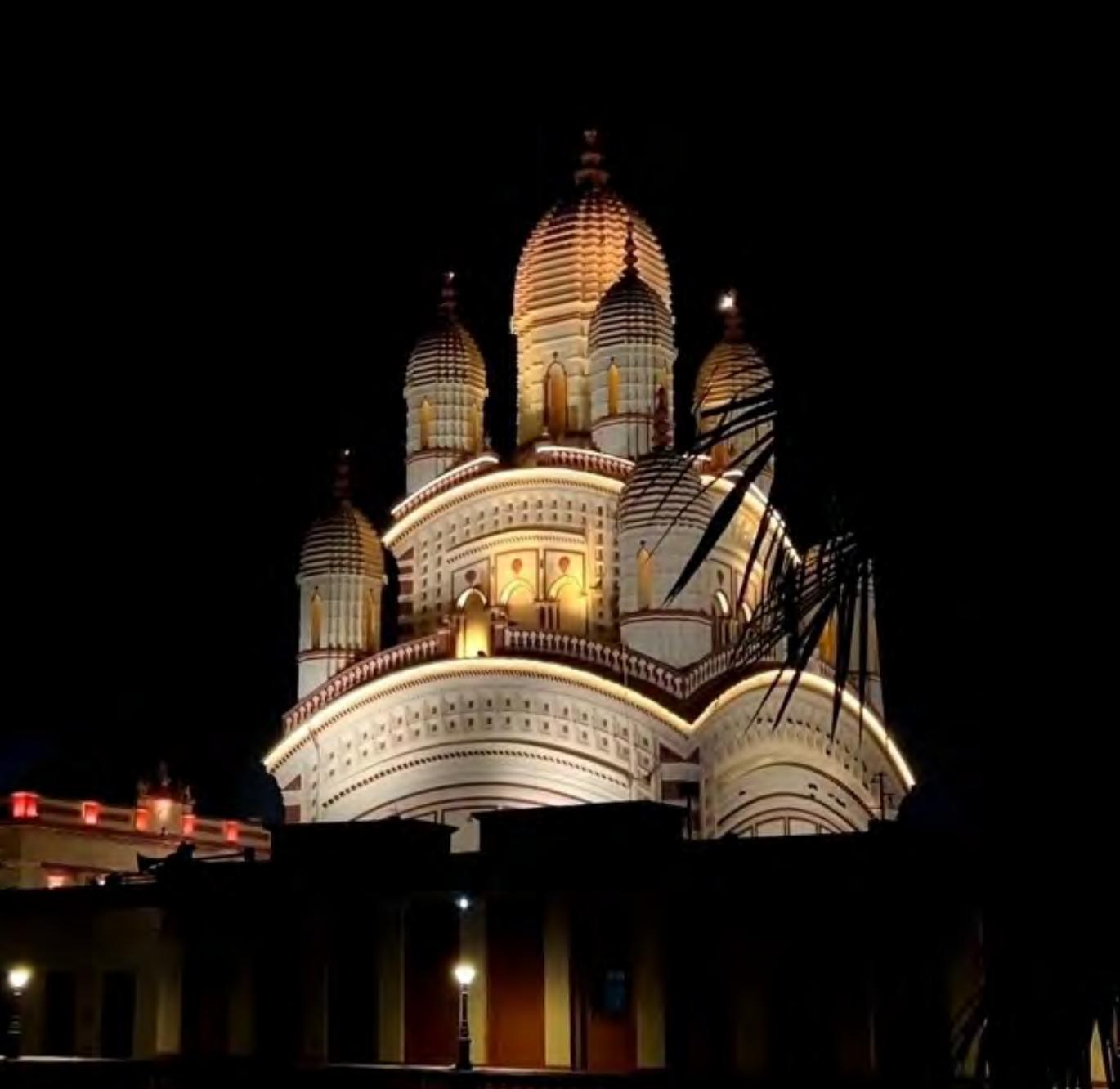
Dakshineswar Kali Temple built in 1855, West Bengal India